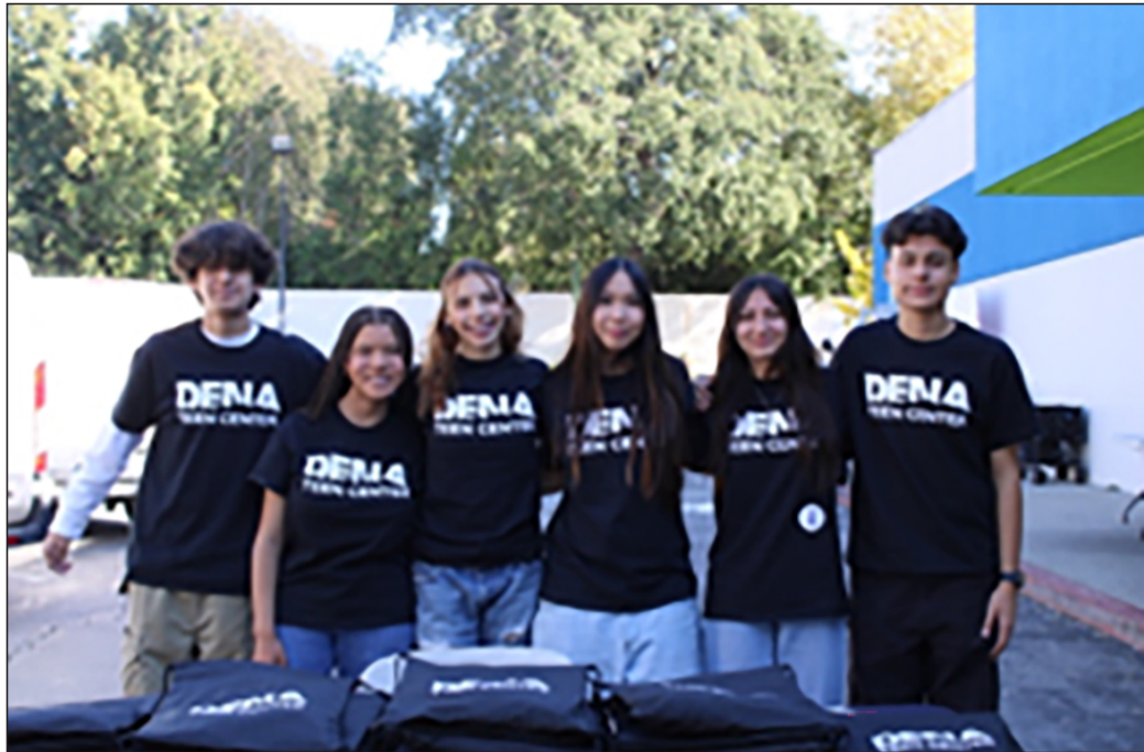
Teens, families, and supporters celebrated the new space with free food, activities, and ribbon cutting led by the Mayor of Pasadena

Pasadena, CA – On Saturday the Boys & Girls Club of Pasadena (BGCP) proudly celebrated the grand opening of its new Dena Teen Center, a dedicated 10,000sf space for teens from Altadena, Pasadena, and Sierra Madre. As a major milestone in the Club's Future Ready work, the Dena Teen Center officially opened its doors at the BGCP Clubhouse at 2020 North Fair Oaks Avenue, featuring a newly designed, fully separate entrance and space created specifically for high school youth.